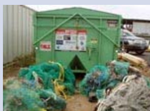
Hawaii's Nets to Energy