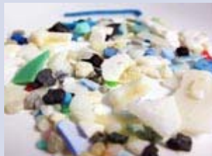
International Research Workshop on the Occurrence, Effects, and Fate of Microplastic Marine Debris