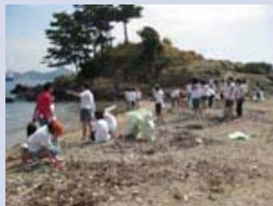
Joint Marine Debris Project with Republic of Korea