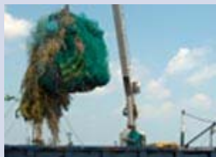
Fishing for Energy