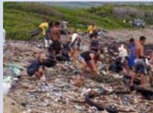
Hawaii Marine Debris Action Plan (HI-MDAP)

Updates and information on marine debris projects across the US led by or involving the NOAA Marine Debris Program.