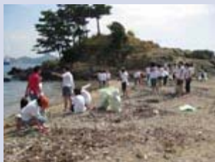
Joint Marine Debris Project with Republic of Korea