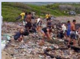
Hawaii Marine Debris Action Plan (HI-MDAP)

Updates and information on marine debris projects across the US led by or involving the NOAA Marine Debris Program.