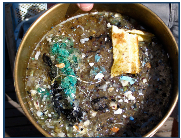
Small plastic pieces, such as microplastics (< 5mm), may be found in areas of marine debris concentration, such as the “garbage patches.”